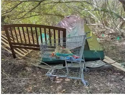
Aug 19: Camp above Sixth