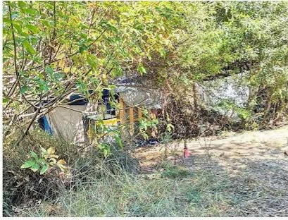
Sept. 22: Camp has become large compound.