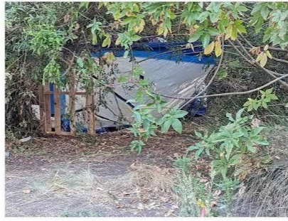
Aug 22: Tarp and crate walls begin expansion