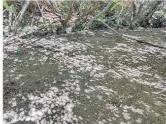
Sept. 27: Bare bank left when camp removed.