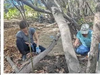
Sept. 30: Installing erosion control at creek edge.